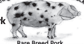
Rare Breed Pork

Pedigree Rare Breed Oxford and Sandy Black Pork Slow Grown, Grass Fed Lamb